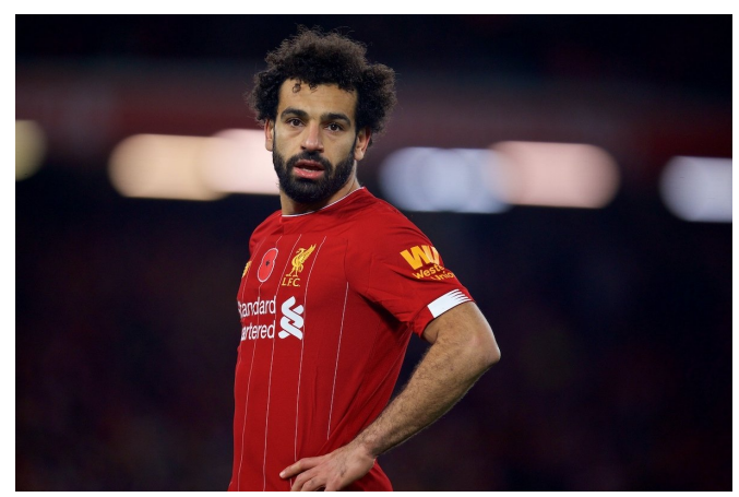
Mo Salah being sassy

Something like this but not as complicated, needs to be more streamlined