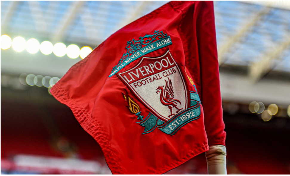
Color scheme and feel of the website should be kind of like this